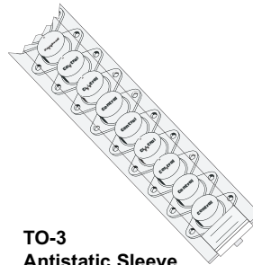
TO-3 Antistatic Sleeve